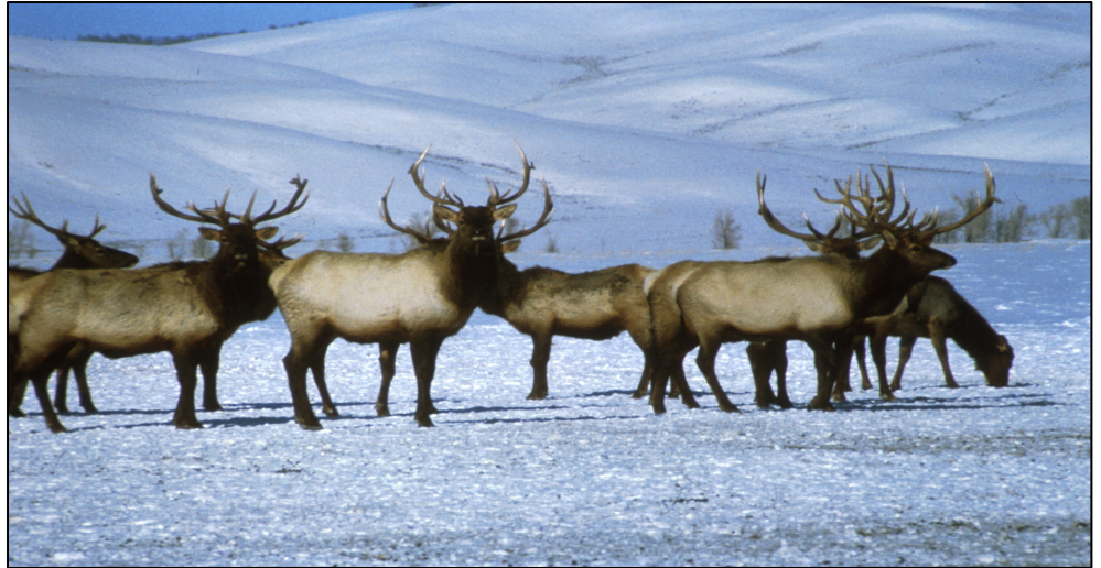
National Elk Refuge, Wyoming

In 1991, the endangered black-footed ferret was first released in Wyoming's Shirley Basin. Similar releases occurred on National Refuges and state managed lands across Colorado, Montana, and Arizona.