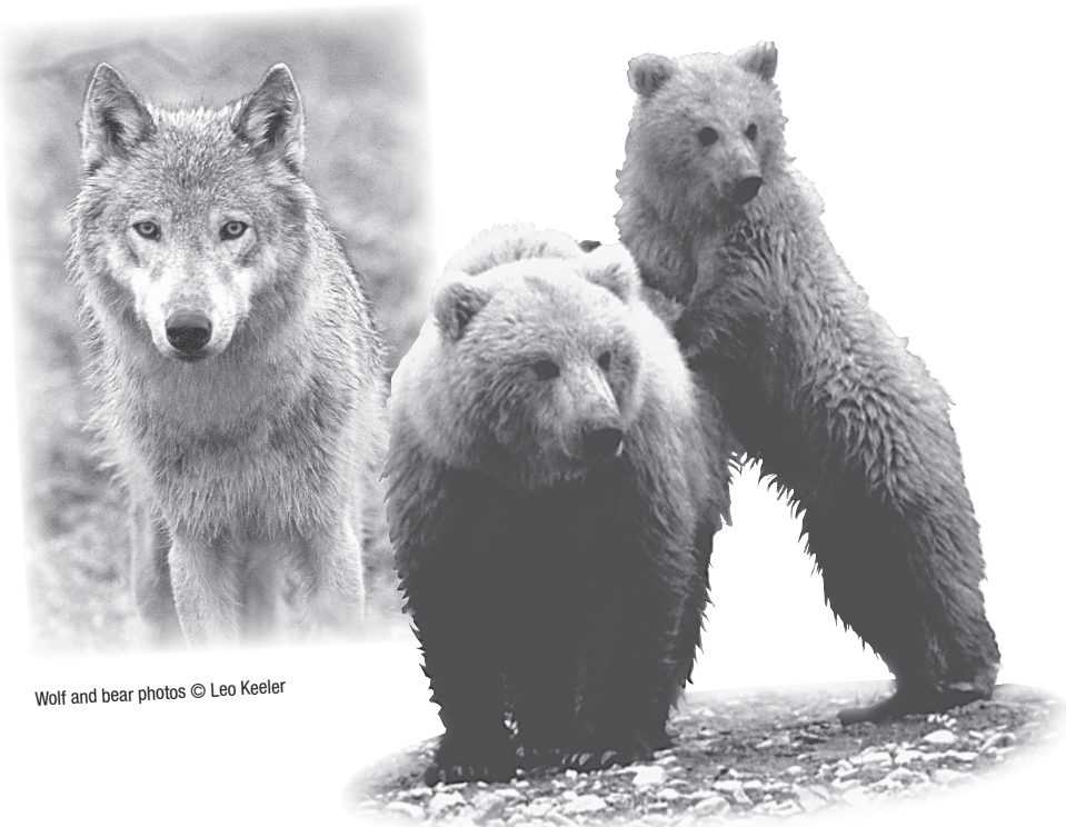
Wolf and bear photos