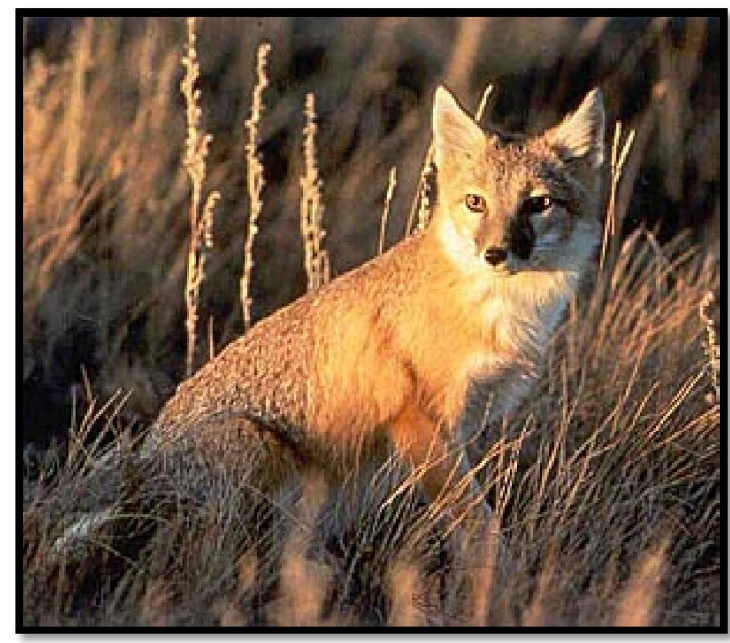
Swift fox.

Once abundant, swift fox now only inhabit about 60% of their former range. They rely on shortgrass and mixed-grass prairies of the Great Plains for prey and shelter. As a generalist and opportunistic forager, swift fox hunt primarily in open plains for various mammals, birds, insects, plants, and carrion. A majority of this habitat overlaps with and has been greatly impacted by cropland and other habitat conversions. Esubsidies are a driving force behind this habitat loss – a recent USDA report found that certain farm subsidies (crop insurance, marketing loans and disaster assistance payments) increased the conversion of wildlife habitat by 2.3 million acres in just a portion of the Northern Plains from 1997 to 2007. iii Recent analysis shows that conversion of habitat to cropland is similarly high in swift fox range; counties in the swift fox range lost more than 900,000 acres of grassland, shrubland and wetland between 2008 and 2011.iv