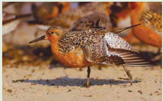
Red knots

are illegally plowing through forests and uplands on all-terrain vehicles, tearing up vegetation and soils and disturbing nesting birds and other wildlife. Because the habitat at this refuge is so segmented by roads and private land, it is impossible to stay on top of this problem and protect the biological integrity of the refuge without more law enforcement—the Fish and Wildlife Service's most basic duty at refuges. In fact, the first staffer at the first refuge, Pelican Island, was a game warden. A 2005 comprehensive assessment by the International Association of Chiefs of Police found that refuge law enforcement capability was woefully inadequate, 18 inhibiting the Fish and Wildlife Service's ability to protect public safety and refuge resources—in other words, inhibiting the service's ability to carry out the reforms Congress mandated in the refuge improvement act.