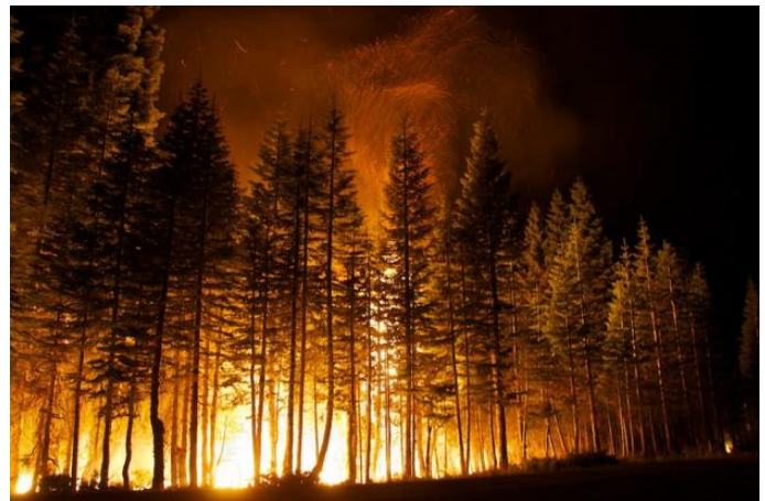
California Wildfire

One agency, the U.S. Forest Service, had EISs that fell into all six categories, from fairly thorough analysis to no mention of climate change. This held true when looking across the various types of projects analyzed by agency in the various EISs (see Table 2). For instance, some forest management EISs gave fairly detailed consideration to climate change and its implications for the future of the forest, while others barely or never mentioned it, including one on a national forest that identified drought, fire and bark beetles as ongoing management issues.