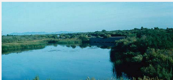
Colorado River

This section also discussed issues such as method of downscaling, the difficulty of accounting for Colorado's topographic complexity, and model agreement over different time frames. The project then summarized the projected results of the selected model.