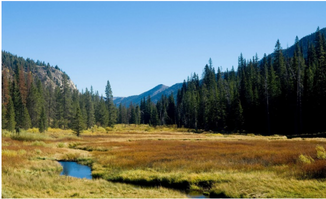
National Forest System (USFS)