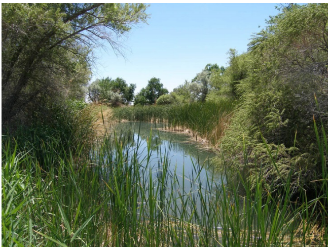
Desert National Wildlife Refuge (USFWS)