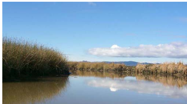
Suisun Marsh

Several EISs fell into the second category, covering a wide array of potential climate changes, but only assessing their effects on a limited subset of resources within the affected environment. The Sears Point Watershed Restoration Project mentions a number of projections for climate change effects in California, such as more extreme heat, reduced snowpack, and changes in the distribution of plant communities. However, analysis is silent on the effects these changes might have on the biological resources covered in the EIS. Similarly, the Upper Truckee River Restoration EIS discusses the potential for climate change effects in the sections on Hydrology & Flooding and Geomorphology & Water Quality, but the impacts of climate change are not discussed at all in the Biological Resources section.