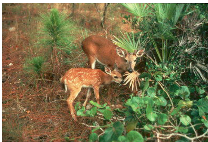
Key Deer

elements that we assessed. Further, the treatment of “Impact of climate change on reasonably foreseeable future condition of affected resources” under “No Action” and under “Alternatives,” was a weakness for many EISs. It was common for this very critical aspect of the analysis to cover only a small subset of the elements of the affected environment, to fail to make a full comparison between the various alternatives, or to use short and qualitative, or pro forma statements rather than full analysis based on the best available science.