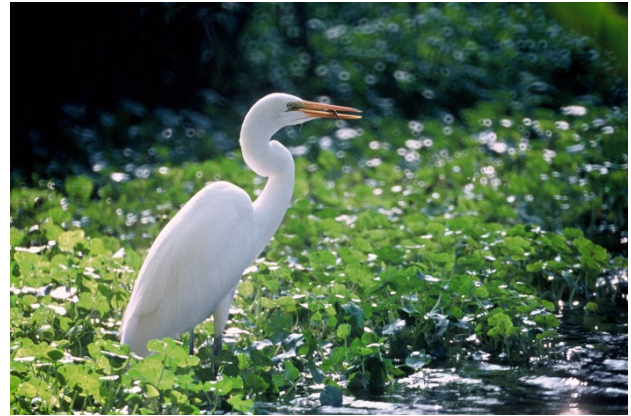
Great Egret

The Environmental Impact Statement (EIS) discloses impacts of a proposed action, evaluates alternatives, and identifies irreversible and irretrievable commitments of resources—for “major actions significantly affecting the quality of the human environment.” 42 U.S.C. § 4332(2)(C). An EIS serves two purposes: