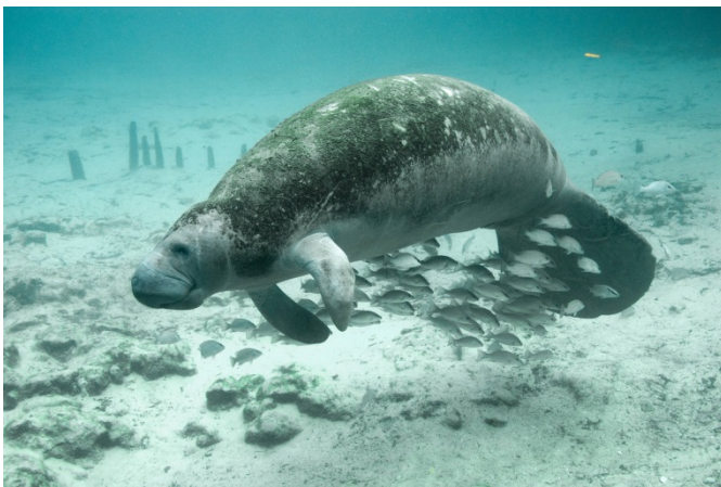
Endangered Manatee, Crystal River National Wildlife Refuge

Importantly, from our perspective, this analysis did not assess the impacts of the project on aspects of the affected environment that are also being or likely to be impacted by climate change in the future. In addition to being a clearly articulated aspect of the guidance, we consider this to be very important in order to fully and accurately evaluate impacts, particularly to aquatic and terrestrial habitat and biodiversity, including species protected under the Endangered Species Act. We thus conducted our own analysis of EISs in order to understand in detail how well federal agencies were incorporating the adaptation-related portions of the CEQ climate change guidance.