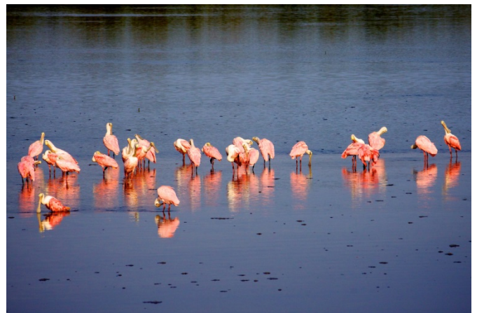
Flamingos, Ding Darling National Wildlife Refuge

cumulative risks that may render a previously practicable project infeasible or imprudent, due to either impacts to the project, impacts to the environment, or in some cases both.