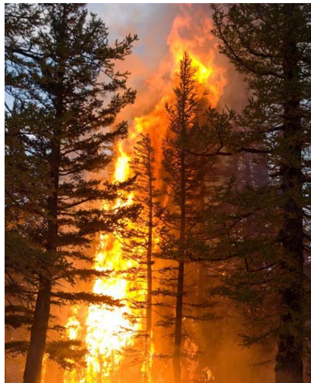
Wildfire, Okanogon-Wenatchee National Forest

“Whether the action is related to other actions with individually insignificant but cumulatively significant impacts. Significance exists if it is reasonable to anticipate a cumulatively significant impact on the environment. Significance cannot be avoided by terming an action temporary or by breaking it down into small component parts” (§1508.27).