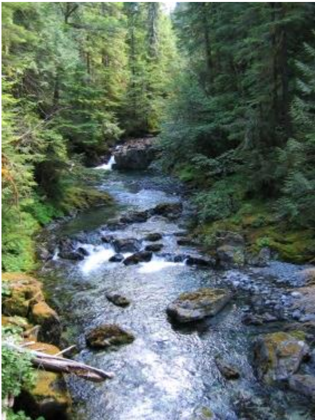
Opal Creek Wilderness, Oregon

Several EISs only discussed specific climate outcomes for the preferred alternative, instead of comparing all alternatives. The Snow Basin EIS states that: “All three action alternatives manage the forest ecosystem so that it is better able to accommodate climate change and to respond adaptively as environmental changes accrue.” The Deschutes and Ochoco national forests’ travel management plan also compared the alternatives to no action, but did not differentiate between alternatives.