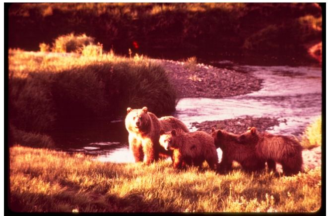
Grizzly Bear with Cubs, Yellowstone National Park (NPS)

speculative to predict localized changes in snow water equivalency or average winter temperatures, in part because many variables are not fully understood and there may be variables not currently defined. Therefore, the analysis in this document is based on past and current weather patterns and the effects of future climate change are not discussed further.” [Yellowstone National Park Draft Winter Use Plan].