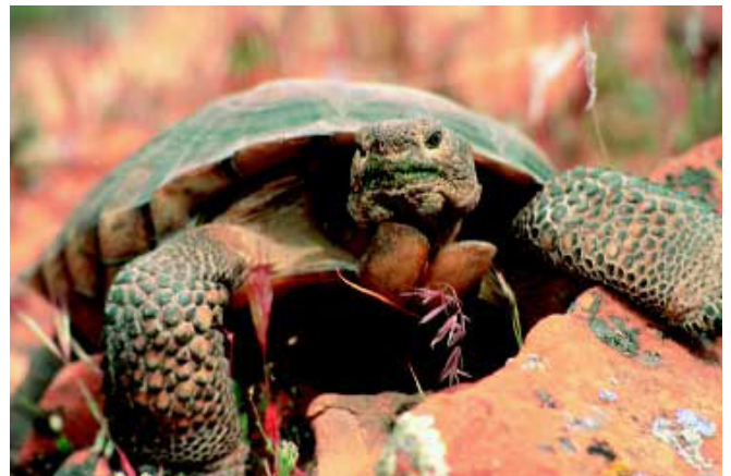
Sonoran Desert Tortoise

The cumulative impact of an action is the impact on the environment which results from the incremental impact of the action when added to other past, present, and reasonably foreseeable future actions regardless of what agency (Federal or non-Federal) or person undertakes such other actions. Cumulative impacts can result from individually minor but collectively significant actions taking place over a period of time. The discussion of environmental consequences should also include “means to mitigate adverse environmental impacts” (1502.16h).