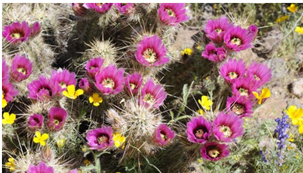
Flowering Barrel Cacti (USFWS)