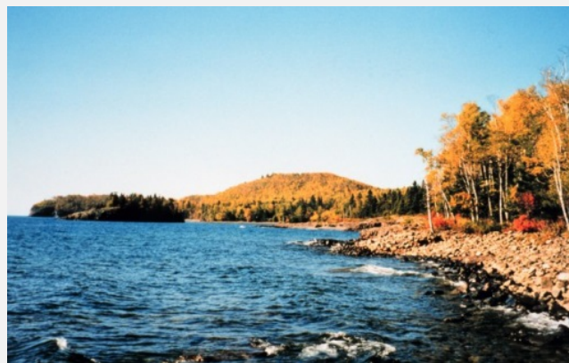
Lake Michigan Coast

On the other end of the climate science spectrum, the Illinois Coastal Management Plan: while it does include climate change impacts in its analysis and articulates adaptation benefits, it does so with some of the weakest attribution language of any EIS we reviewed: “Climate change may be due to natural external factors, such as changes in the emission of solar radiation or slow changes in the Earth's orbital elements, natural internal processes of the Earth's climate system, anthropogenic forcing, such as an increase in the concentration of greenhouse gases, or combinations of these factors.”