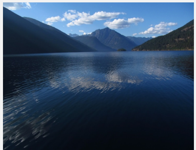
Ross Lake (Flickr /Pictoscribe - Home Again)

The coastal projects also failed to consider at the outset how climate change might affect the purpose and need. The Biscayne Bay project, whose impacts are later analyzed in the context of climate change, summarizes its major objectives as "improving and/or restoring the proper quantity, quality, timing and distribution of water in the natural system while also addressing other concerns such as urban and agricultural water supply and maintaining existing levels of flood protection " (emphasis added). Another coastal wetlands project, Suisun Marsh, sets out a series of objectives related to habitat, land use, flood protection and water quality, but does not put those in the context of sea-level rise until later in the document.