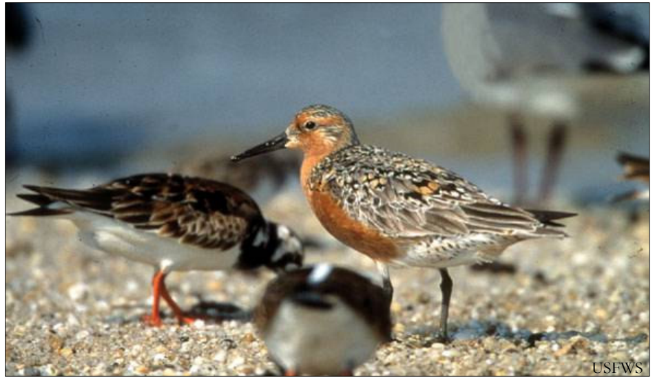
Ruddy Turnstones and Red Knots, Cape May National Wildlife Refuge