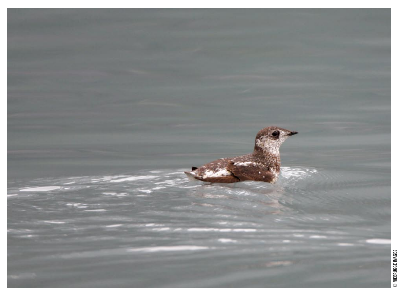
A Kittlitz's murrelet in breeding plumage in the high Arctic. These robin-sized seabirds have large eyes that help them spot krill and small fish in the murky waters where glaciers meet the sea. These murrelets also nest near coastal glaciers, scraping out small depressions in loose rock on steep slopes in which the female lays a single egg. Their drab breeding plumage helps the birds blend into their rocky nesting grounds.

many young murrelets probably flutter downhill to nearby glacial streams or rivers and float downstream to the sea.