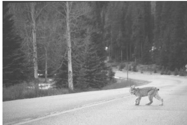
Figure 1. Lynx crossing highway.

For the purposes of this paper, carnivores will be loosely defined as small, mid-sized and large. Small-sized carnivores include weasel ( Mustela nivalis ), mink ( Mustela vison ), skunks ( Mephitis spp ), red fox ( Vulpes vulpes ), gray fox ( Urocyon cinereoargenteus ), kit fox ( Vulpes macrotis ), swift fox ( Vulpes velox ), opossum ( Didelphis virginiana ), and American marten ( Martes americana ). Mid-sized carnivores are arbitrarily grouped as river otter ( Lutra canadensis ), raccoon ( Procyon cancrivorus ), bobcat ( Lynx rufus ), lynx ( Lynx canadensis ), wolverine ( Gulo gulo ), ocelot ( Felis pardalis ), coyote ( Canis latrans ), jaguarundi ( Felis yagouaroundi ), badger ( Taxidea taxus ) and fisher ( Martes pennanti ). Recommendations for most small and mid-sized carnivores are grouped together in this paper because often they are present together on the landscape, differential crossing prescriptions are not well understood and practical highway structure designs for these species would usually be similar.