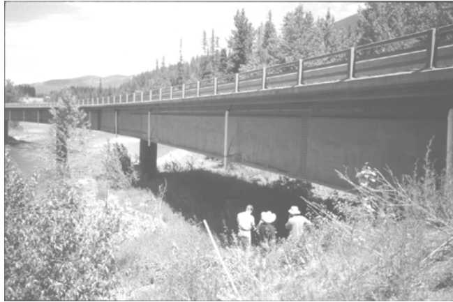
Figure 4. Bridges with adequate end-space can be excellent wildlife crossings. Bridges need to be both high and wide enough for target species.

Engineers and biologists must work hand in hand in designing and building