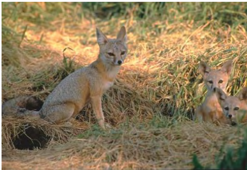
Endangered San Joaquin kit fox

1130 17 th Street, NW Washington, DC 20036 Phone: 202-682-9400 Fax: 202-682-1331 Web: www.defenders.org