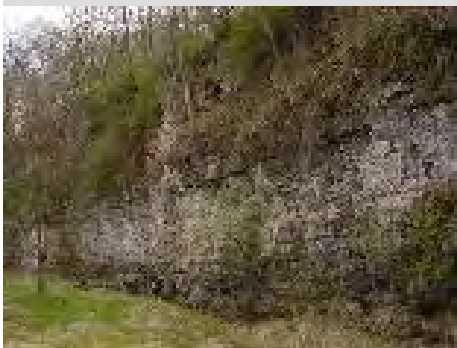
Algific talus slopes

Algific slopes support Iowa Pleistocene snails, the northern monkshood, and other unusual species. These steep slopes are comprised of talus at the base and are connected to upslope sinkhole drainage systems.