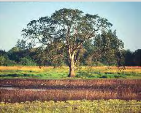
Wapato Lake area