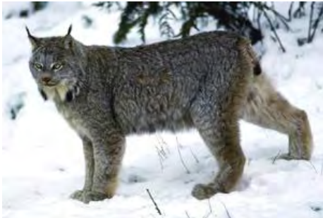
Threatened Canada lynx