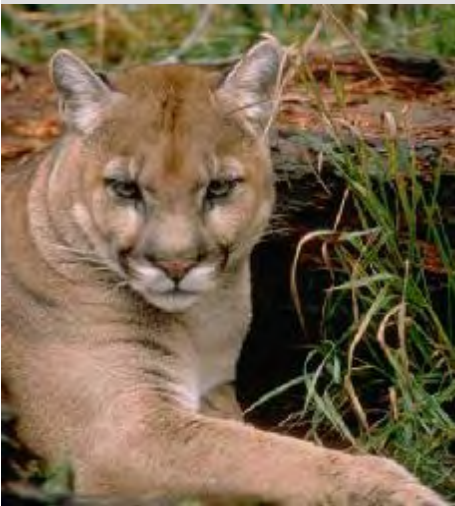
Endangered Florida panther

The project area will unite the Osceola National Forest and Okefenokee National Wildlife Refuge, creating one of the largest protected areas in the eastern United States.