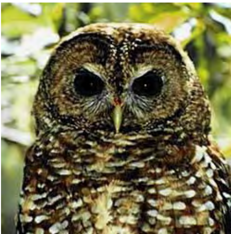
Threatened Northern spotted owl

This project supports Washington's State Wildlife Action Plan