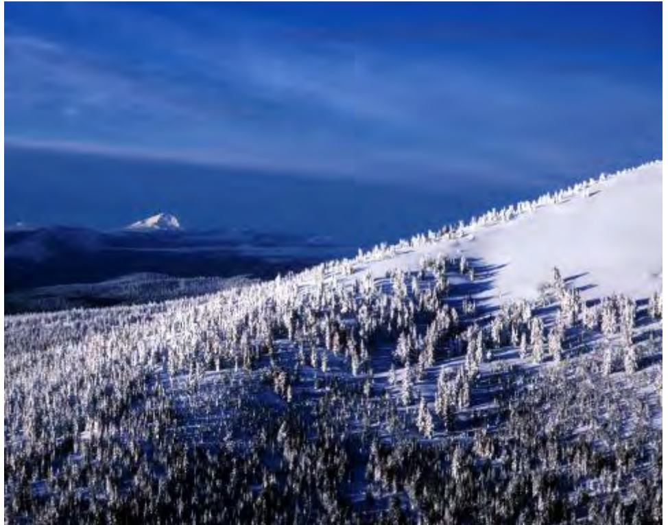
Cascade mountain range, Oregon