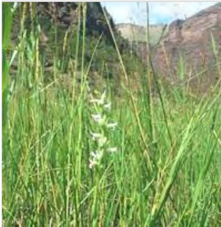
Threatened Ute-ladies'-tresses orchid