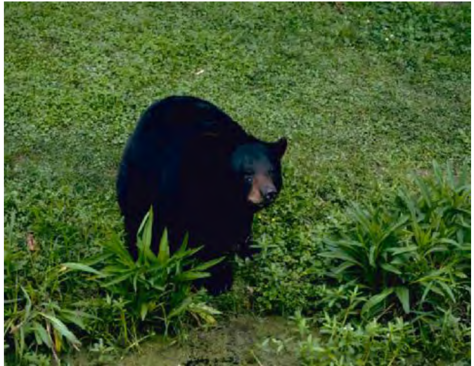
Threatened Louisiana black bear