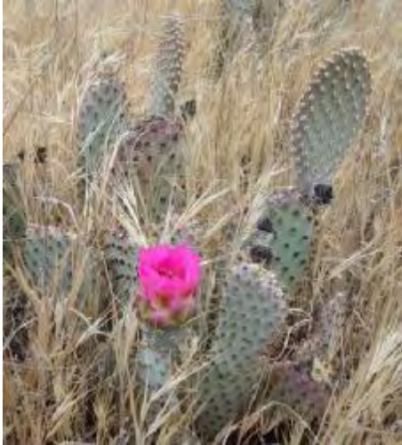
Endangered Bakersfield cactus