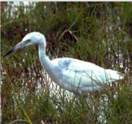
juvenile Little blue heron

Virtually the entire North American Red knot population gathers along the Delaware Bay each May to rest and fuel up on horseshoe crab eggs before continuing their migration to Arctic breeding grounds. Red knots rely on horseshoe crab spawning season coinciding with this stopover since they, incredibly, only stop once along their long migration route. In recent times, human overfishing has caused horseshoe crab egg numbers to crash, causing a similar precipitous decline in Red knots.