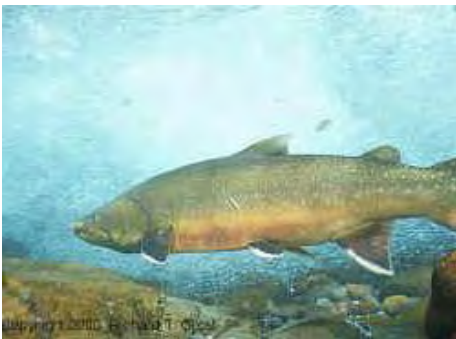
Threatened bull trout

Flathead NF currently includes over one million acres of designated Wilderness including the Swan River, which supports one of the very few stable populations remaining of the threatened bull trout.