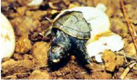
Western pond turtle, species of concern

Acquisition of the proposed Wapato Lake Unit will protect, restore, and develop habitats for federally-listed threatened and endangered species, and may help prevent the listing of existing and future candidate species.