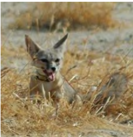
Endangered San Joaquin kit fox

This project supports California's State Wildlife Action Plan