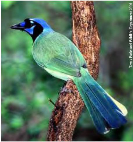
Texas Parks and Wildlife Department 2006