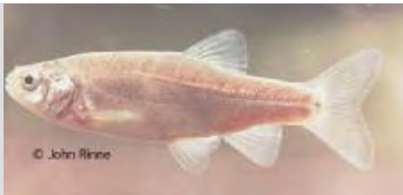
Endangered Yaqui chub

This project supports Arizona's State Wildlife Action Plan