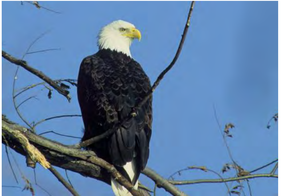
Threatened bald eagle