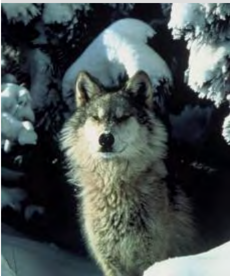
Threatened gray wolf

The Blackfoot River watershed is located within the Northern Continental Divide Ecosystem and serves as a "southern bookend" for the Yellowstone Conservation Initiative. The watershed is a key buffer and linkage area for wildlife moving to and from the Bob Marshall/Scapegoat Wilderness Complex, along the Continental Divide and between the Clark Fork River drainage and Garnet Range.