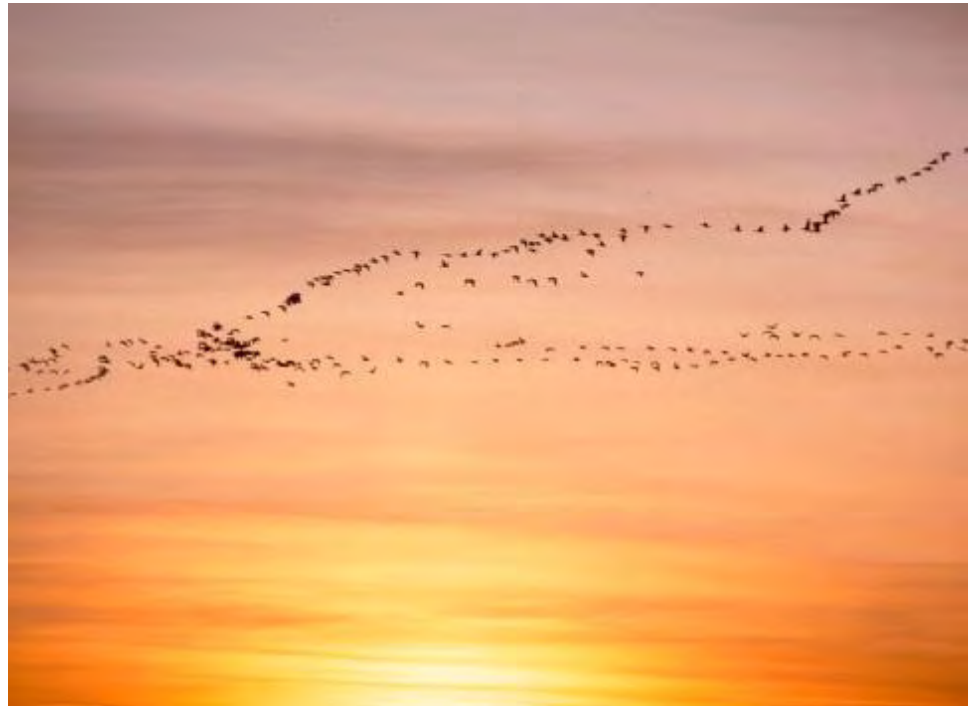
Migrating snow geese