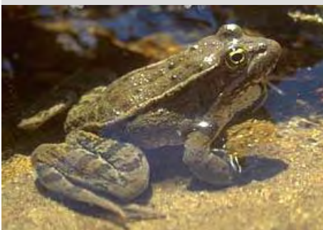
Threatened California red-legged frog

California condor, California spotted owl, San Joaquin kit fox, Mohave ground squirrel, blunt-nosed leopard lizard, California red-legged frog, striped adobe lily, Bakersfield cactus, and Mexican flannelbush