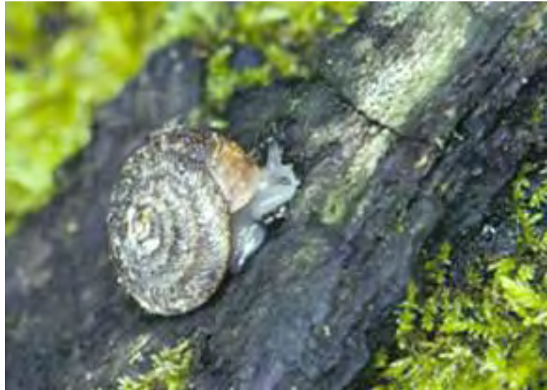
Endangered Iowa Pleistocene snail