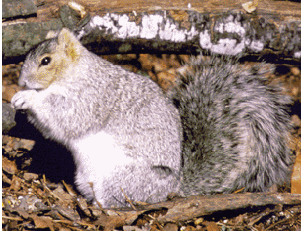
Endangered Delmarva fox squirrel