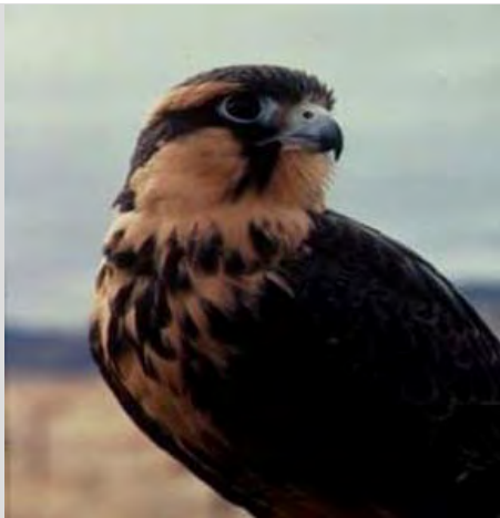
Endangered Northern aplomado falcon

Endangered & Threatened Species at the Refuge include the ocelot, jaguarundi, piping plover, Northern aplomado falcon, peregrine falcon, Wilson's plover, reddish egret, loggerhead sea turtle, and Kemp's Ridley sea turtle.