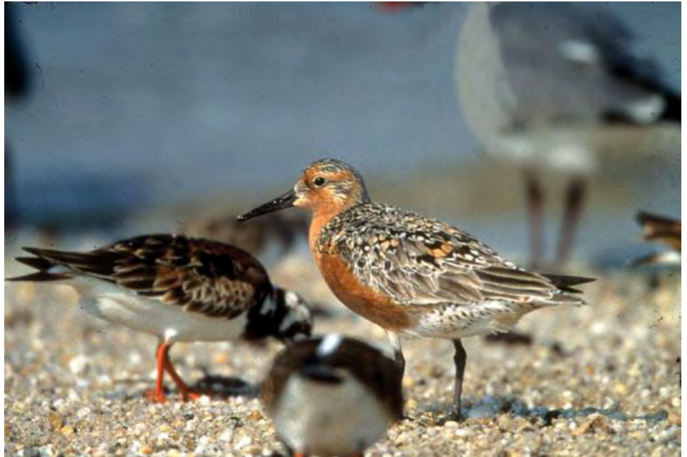
Red knot with ruddy turnstones