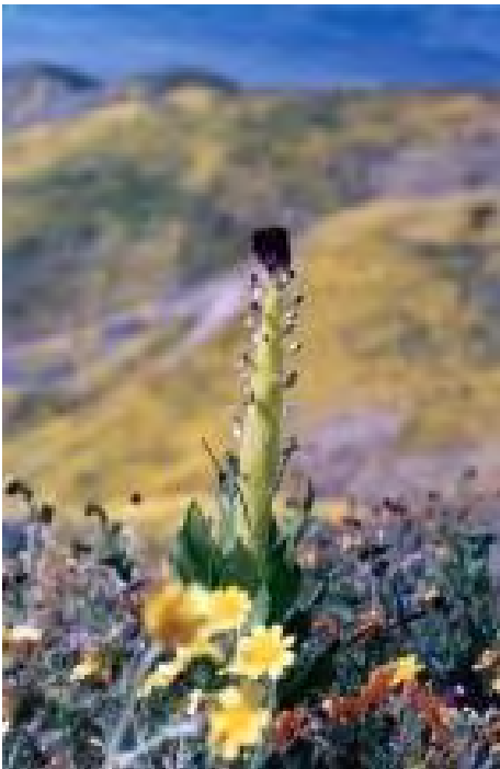
Endangered California jewelflower

This project supports California's State Wildlife Action Plan