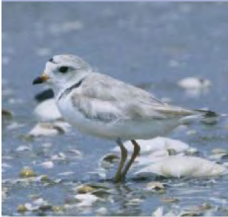
Federally-threatened piping plover

The refuge is home to a variety of New Jersey state-listed species including ospreys, short-eared owls, barred owls, red-shouldered hawks, grasshopper sparrows, little blue herons, red-headed woodpeckers, sedge wrens, yellow-crowned night-herons, northern harriers, black rails, southern gray tree frogs, Eastern tiger and mud salamanders, corn snakes and northern pine snakes. Federally listed wildlife includes bald eagles, peregrine falcons, piping plovers, and swamp pink, a unique lily.