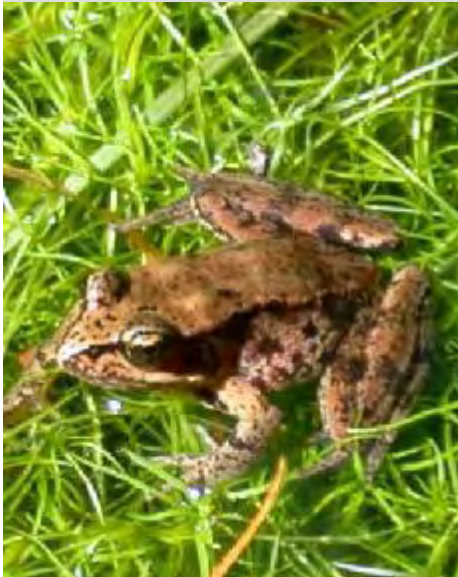
Threatened Northern red-legged frog

Acquisition of the proposed Wapato Lake Unit will protect, restore, and develop habitats for federally-listed threatened and endangered species, and may help prevent the listing of existing and future candidate species.