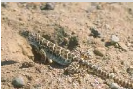
Endangered bluntnose leopard lizard

The Monument's diversity and proximity to over 20 million people living in Southern and Central California attracts thousands of people every year that enjoy wildlife observation, hiking, biking, horseback riding, hunting, camping, and fishing.