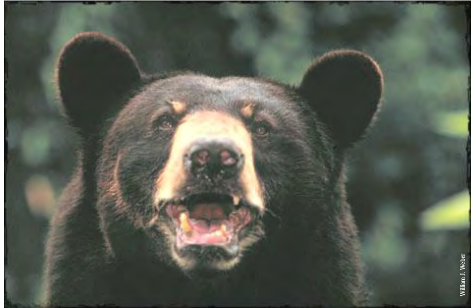
Threatened Florida black bear