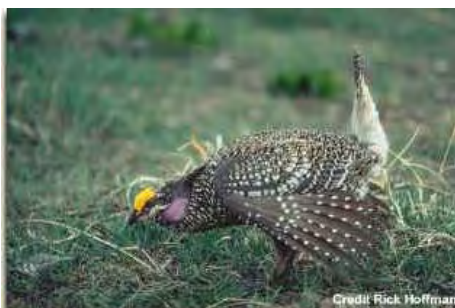
Columbian sharp-tailed grouse