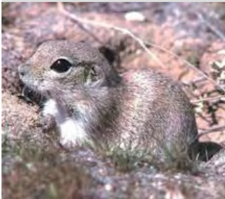
Threatened Mohave ground squirrel

Currently, the Pacific Crest Trail runs through desert in this area of California since the land with the prime “crest” corridor is privately owned. Acquisition would increase intact habitat, provide connectivity between federal lands, and establish a unique “crest corridor”/ non-desert section to the Pacific Crest Trail that will benefit hikers and equestrians.