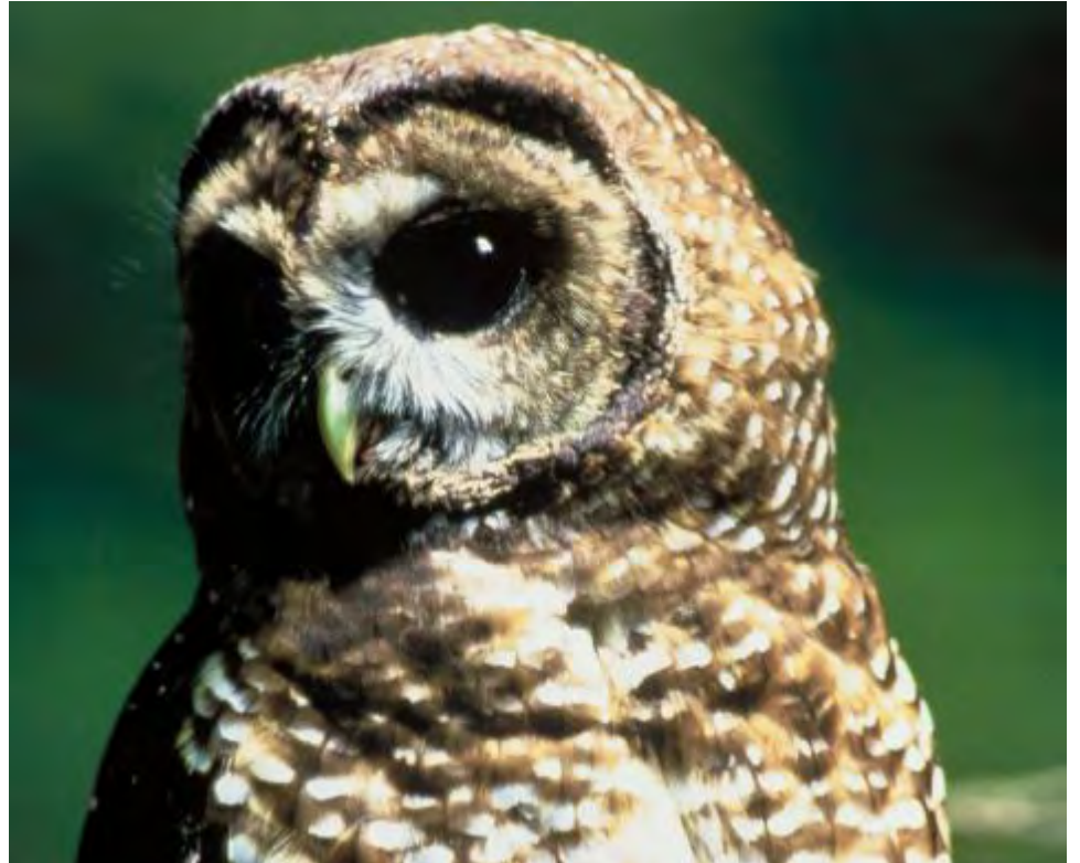
Threatened Northern spotted owl

1130 17 th Street, NW Washington, DC 20036 Phone: 202-682-9400 Fax: 202-682-1331 Web: www.defenders.org