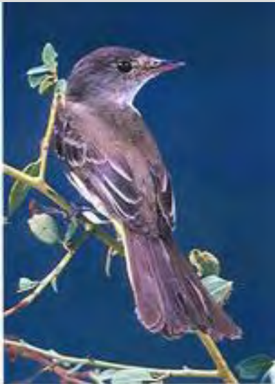
Southwest willow flycatcher

Leslie Canyon NWR is one of the best bird watching areas in the nation. Visitors can also participate in hunting, nature photography, and wildlife observation and study.