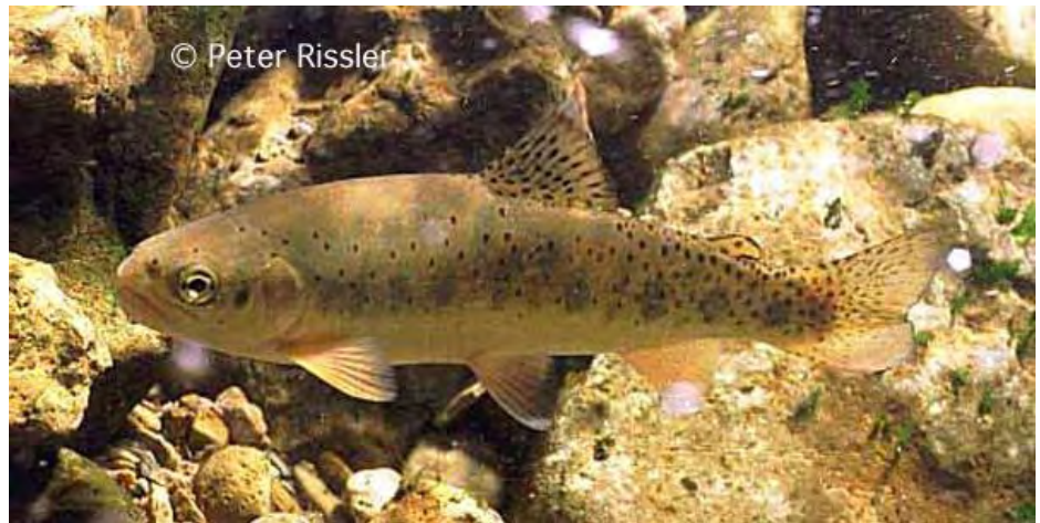
Yellowstone cutthroat trout