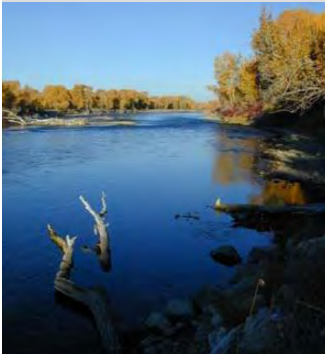
Snake River, Idaho