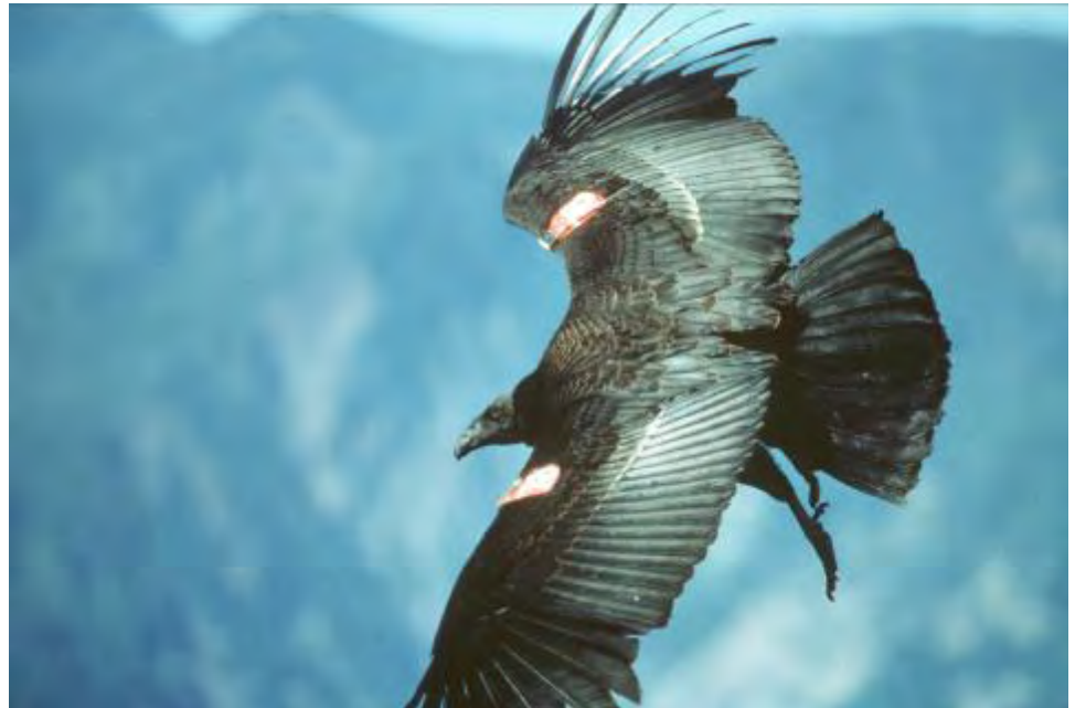
Endangered California condor