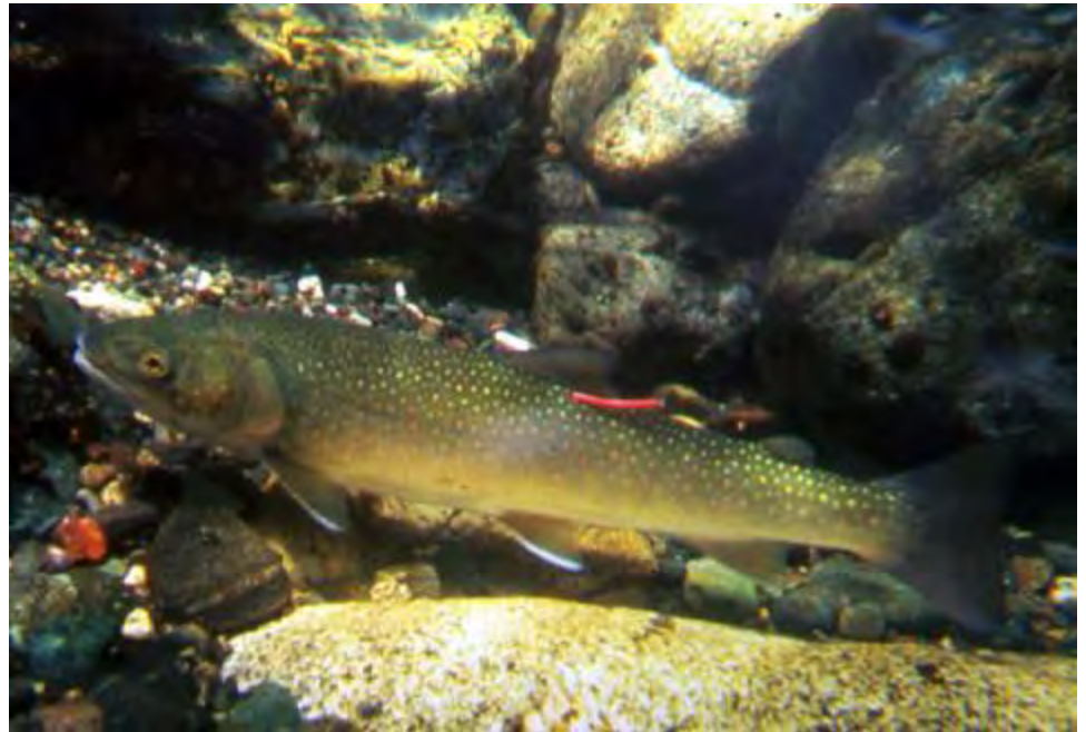
Threatened bull trout