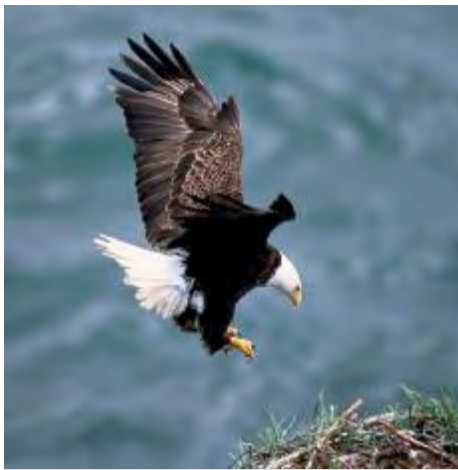
Threatened bald eagle

The Refuge was established in 1933 as a haven for ducks and geese migrating along the Atlantic Flyway. It now supports over 280 species of birds, 35 species of reptiles and amphibians, and large mammals such as white-tailed deer, foxes, and otters.