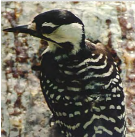
Endangered Red-cockaded woodpecker

The project area is an irreplaceable ecological treasure that is also a potentially valuable natural recreation area for the 2.6 million people who live within a 2-hour drive.