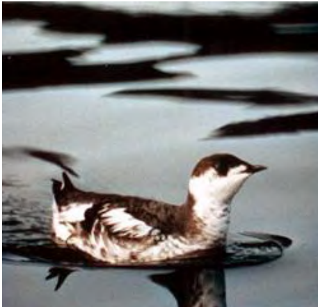
Endangered marbled murrelet