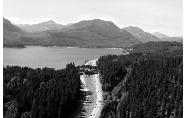
Simulation of overpass to be built for the Snoqualmie Pass East I-90 Project in Washington

USDA Forest Service. "Wildlife Crossings Toolkit." Retrieved from: http://www.wildlifecrossings.info