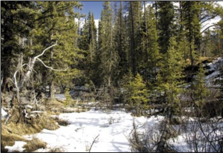
Part of the proposed expansion. Many of these trees would have to be cleared to make room for proposed buildings and camp sites. To the right an old river bank slopes up towards Panther Road.

populated and it was recognized that different types of accommodation would be necessary for diverse tourists and that this would introduce an element of urbanization. However, to minimize disturbance of the area, it was recommended that facilities, or increased urbanization, be concentrated within established transportation corridors and within the present or projected borders of established townsites, and that facilities outside the corridors be encouraged only when they were indispensable to appropriate and desirable recreational uses.