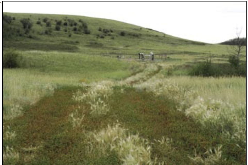
A weedy access road to an unreclaimed well site in the Rumsey Natural Area.

Area designation in 1996, Alberta Energy continued to sell subsurface mineral rights. However, it failed to apply “no surface access” conditions, in clear violation of this agreement. Now Alberta Energy is saying that surface access will be allowed in Rumsey for all mineral dispositions sold to date, many of which date post 2000. West’s 1997 comment still rings true for Alberta Energy: “It wasn’t our intention ever to sterilize that large a piece of the province from our natural resources.”