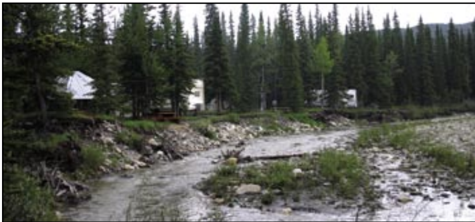
A view of the western shore of Panther River Adventures shows various items from the lease within the buffer zone.