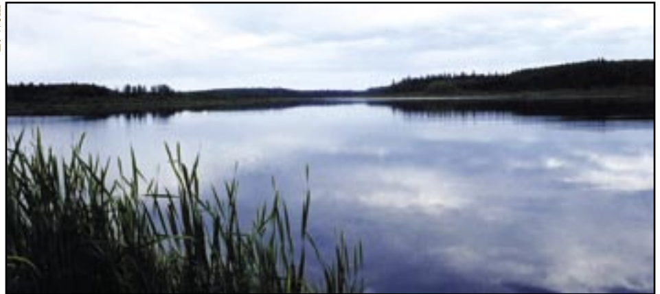
Jackson Lake, Lakeland

the northeast quadrant of the Range with the forests found in the Winnifred Lake region to the north. A third area, the southeast quadrant of the Range, offers a conservation connection with Saskatchewan’s Primrose Lake Ecological and Wildlife Refuges.