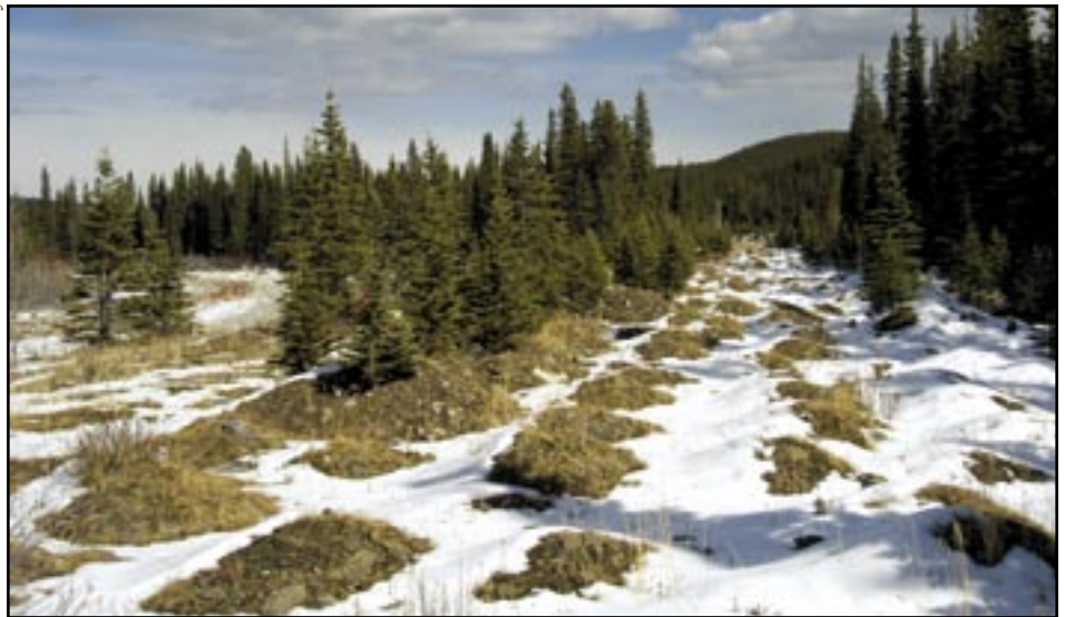
The area of the proposed expansion showing the reclaimed road, the river (left) and a power pole in the distance indicates Panther Road.

The 1974 Land Use and Resource Development in the Eastern Slopes: Report and Recommendations noted that although proposals concerned possible human uses, they all supported retaining the essential qualities of the ES, including protection of wildlife, certain wilderness areas, treasured scenic outlooks, and the opportunity to escape from urban settings.