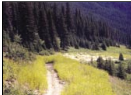
Weedy species along an access route in the Castle Wilderness.

require a different mandate that will allow a holistic approach to managing the Castle and they require more resources for enforcement and for restoring ecological processes.