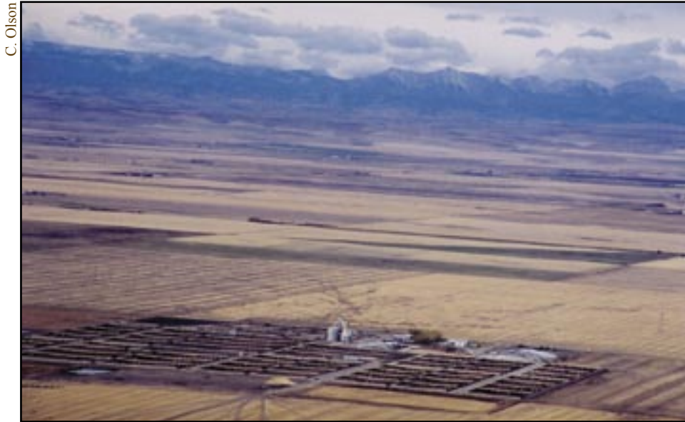
An intensive livestock operation and conventional farms in Southern Alberta.

It is evident that even a small reduction in meat production, or a conversion to more efficient protein production, would result in large reductions in the need for pasture and cropland, particularly on the world’s grasslands. There is no question that both the quantity and quality of food production can be increased with sustainable, natural, locally based systems, particularly if humans convert to a healthier diet.