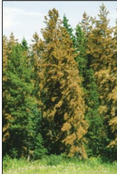
Trees damaged by mountain pine beetle.