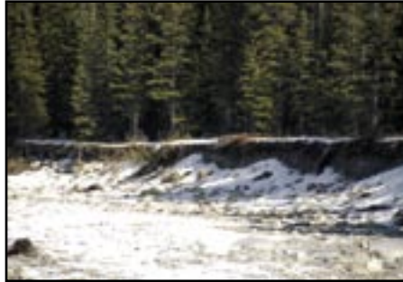
The southern bank of the Panther River adjacent to the proposed expansion shows erosion from the river.

restore a more natural order to what had become a state of increasing anarchy in the area has left an indelible mark in people's memories.