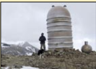
Tourist hot spot?