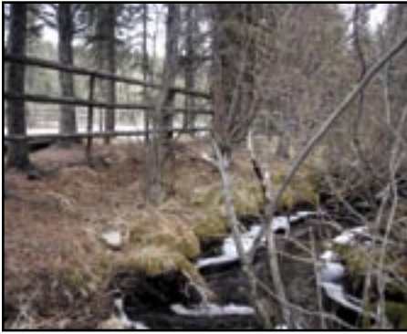
A stream runs through the Panther River Adventures lease close to a corral.