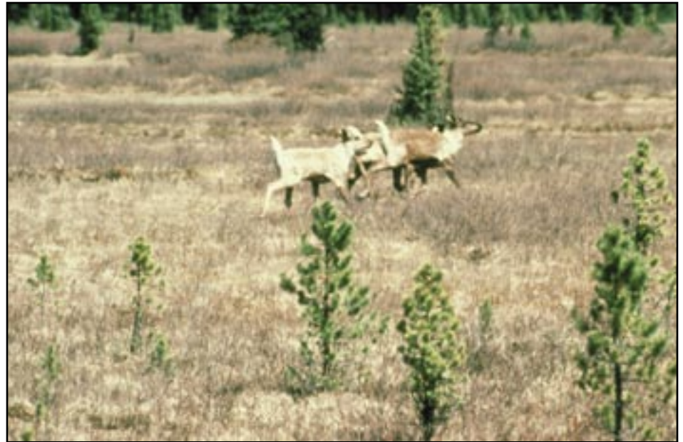
Caribou in Little Smoky.

made on caribou habitat by industrial activity, which was pointed out in the recovery plan as being a limiting factor on woodland caribou habitat, and by extension, caribou survival. Nor was the person told that the recovery plan states that the same habitat change occurring from human activity may be what is increasing the caribou's susceptibility to predation.