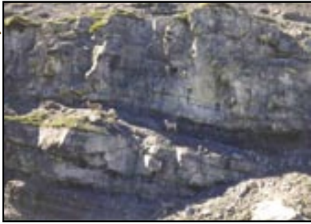
Bighorn sheep on the natural mineral lick on the north side of the Panther River.