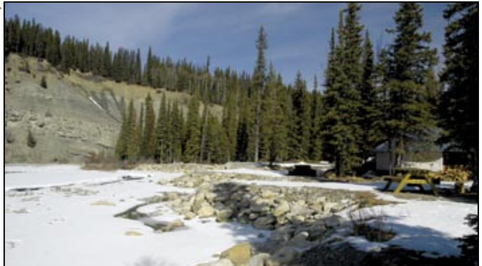
The western shoreline along the Panther River Adventures lease shows rocks placed to protect the bank from erosion, a gazebo, and the natural mineral lick for bighorn sheep across the river on the north shore.

tubs, laced with chemicals unsuitable for disposal in rivers or septic systems, be disposed of? A stream flows beside a corral but no one knows if manure is seeping into it.