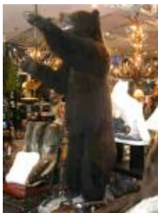
Very nice British Columbia Grizzly (new mount)