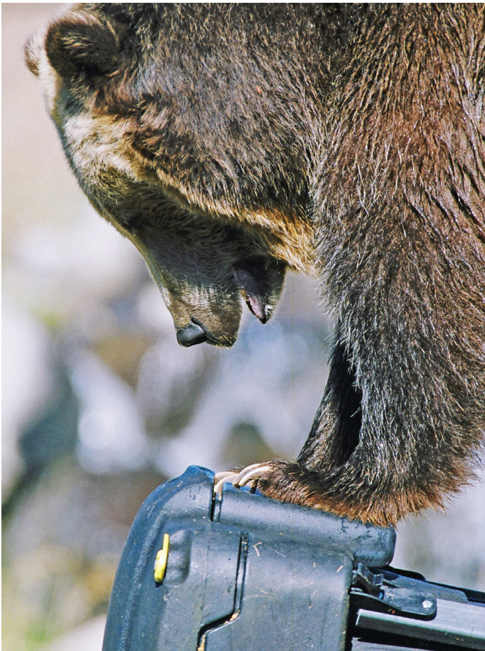
A captive grizzly bear participates in a test of bear-resistant trash containers at the Grizzly and Wolf Discovery Center in Montana.