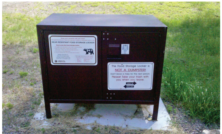
Proven tools of coexistence in grizzly country: electrified fencing around a chicken coop (top) and a food storage locker at a campground (bottom).