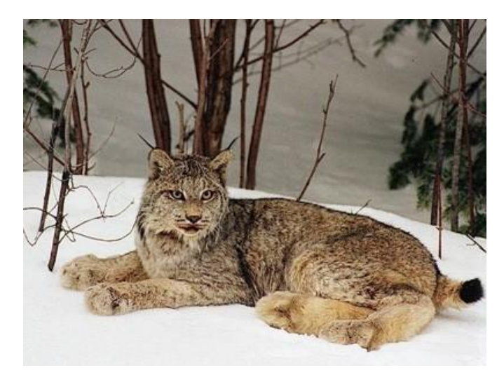
Photo: Maine Department of Inland Fisheries and Wildlife <a href="http://www.maine.gov/ifw/wildlife/species/endangered_species/mammal_list.htm">http://www.maine.gov/ifw/wildlife/species/endangered_species/mammal_list.htm</a>

Halt unnecessary mortality. Hunting and trapping were a major factor in the decline of the lynx. Though it is now protected under the Endangered Species Act, illegal killing does still take place: in 2006, two lynx were illegally killed in Colorado. Defenders is working to correct misperceptions that the species poses a threat to livestock. Collision with vehicles is also a source of mortality for lynx. Federal land management agencies should identify land corridors necessary to maintain connectivity of lynx habitat, map key linkage areas, and identify where highway crossings may be needed to provide habitat connectivity and reduce lynx mortality.