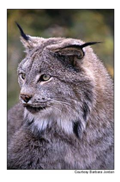
Photo: Courtesy of Barbara Jordan <a href="http://www.blm.gov/or/esa/index.htm">http://www.blm.gov/or/esa/index.htm</a>

By taking immediate steps to reduce greenhouse gas emissions, we can address the root cause of climate change and hopefully minimize the severity of the threat to the lynx. And by embracing the following conservation measures, we can help this species navigate the looming threats posed by climate change.