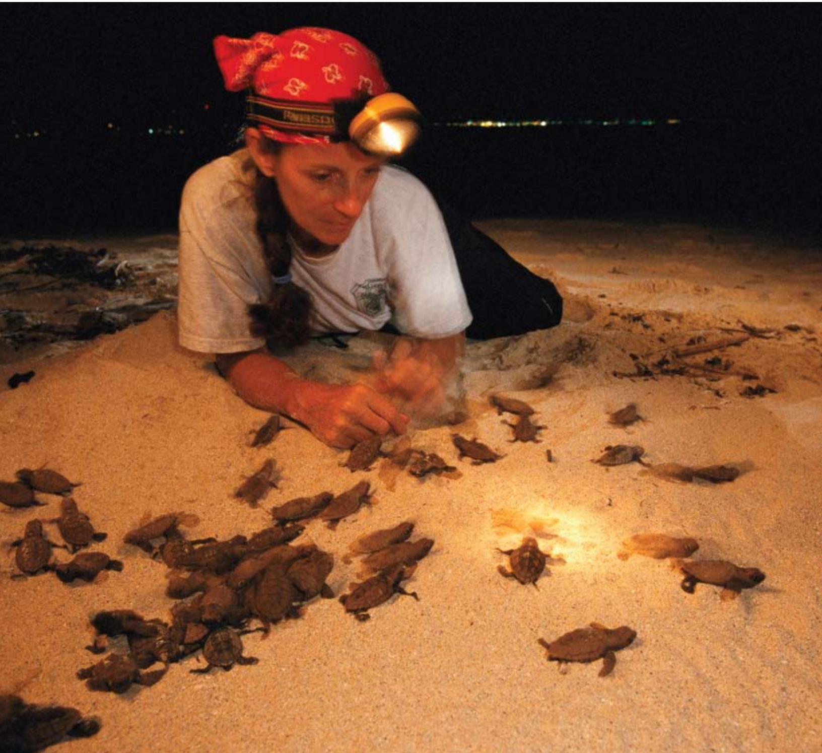
A National Park Service biologist studies Hawksbill turtle hatchlings on a nesting beach in the Virgin Islands. Warmer sands favor the development of females, a bias that could accelerate the decline of this already imperiled species.