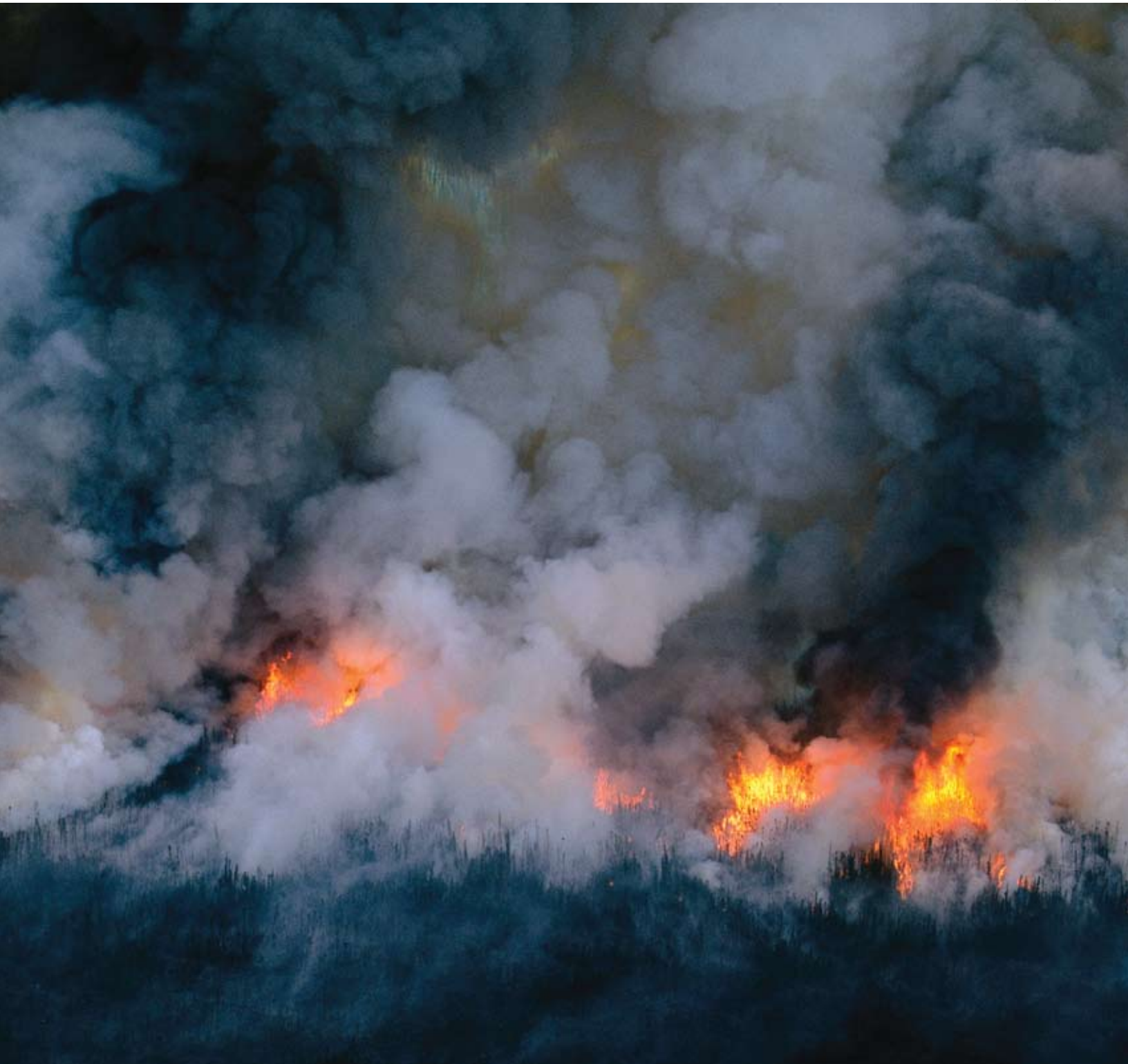
A forest fire rages north of Fairbanks, Alaska. Warmer temperatures linked to global warming mean longer, drier fire seasons and ideal conditions for big blazes.