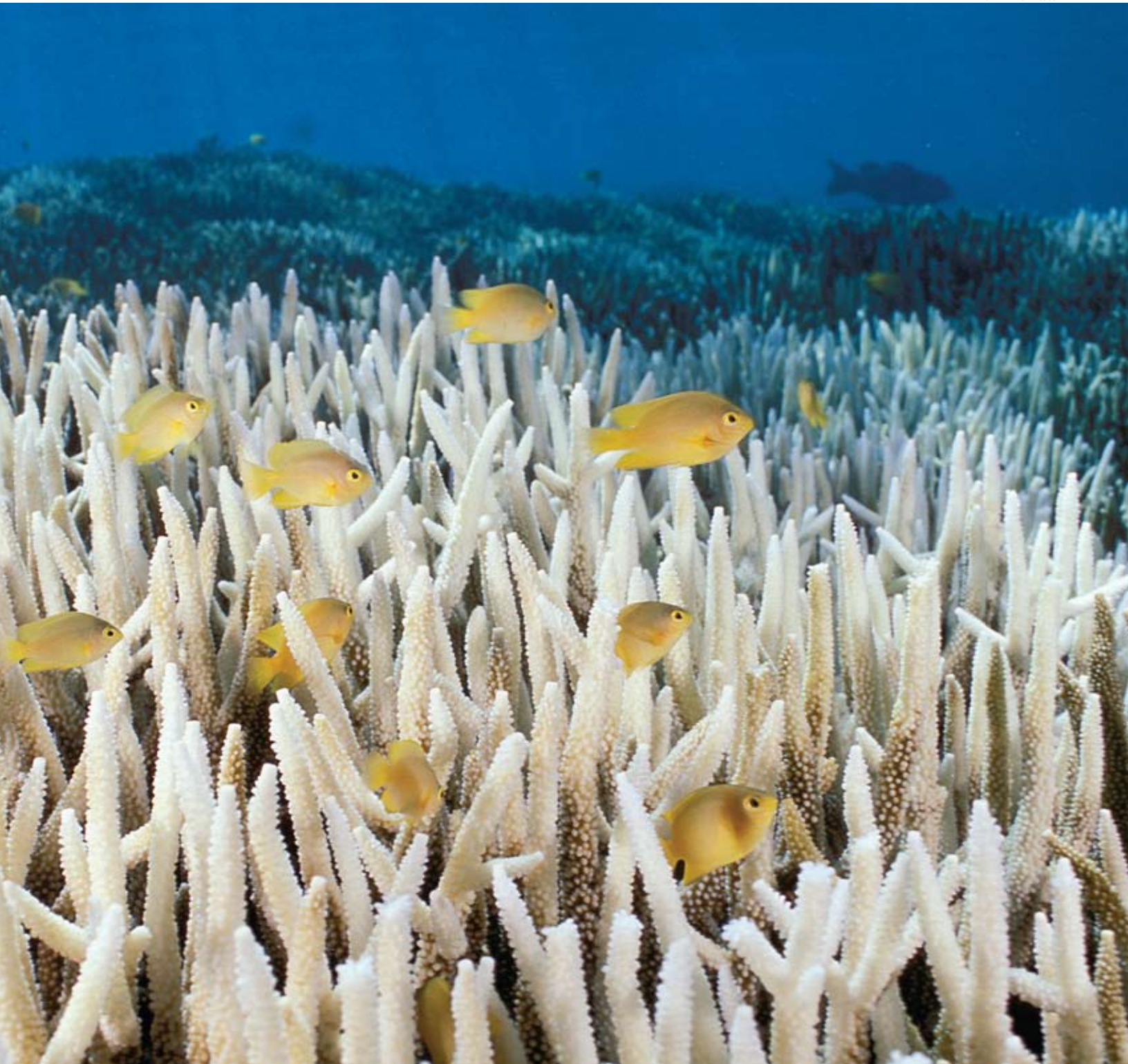
Lemon damselfish swim amid bleached coral on Australia's Great Barrier Reef. Bleaching occurs when rising temperatures increase ocean acidity, driving out the bright-hued algae that sustain and color coral reefs.