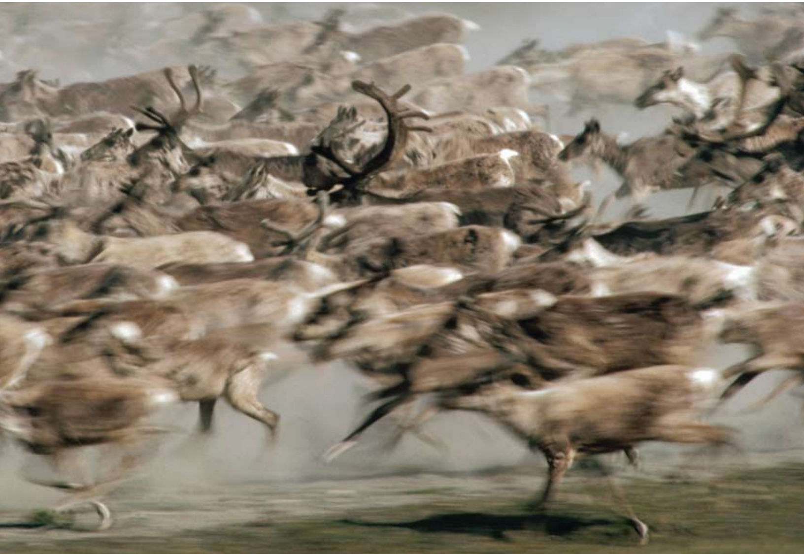
A herd of caribou stampedes through the Arctic National Wildlife Refuge. The Porcupine caribou herd has declined more than 3 percent every year since 1989, possibly due to climate-change-related freezing rain icing over lichens and other vital winter foods.

According to a recent study, 48 percent of harmful invasive species