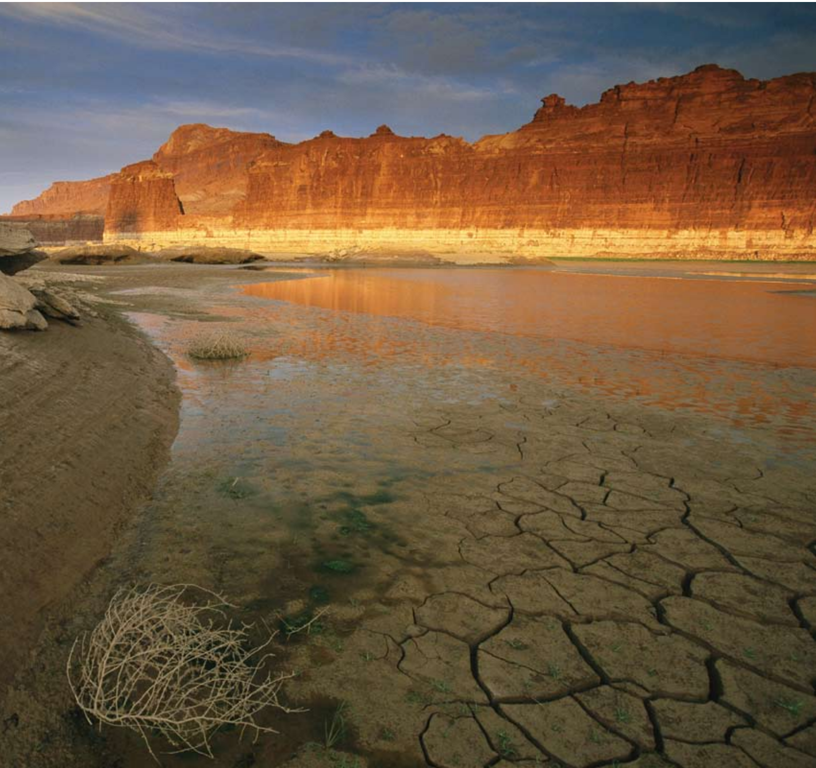
Lake Powell in Utah shows the ravages of a four-year drought. Global warming has heightened concerns about the sustainability of the water level in the lake, a major source of power and electricity in the West.