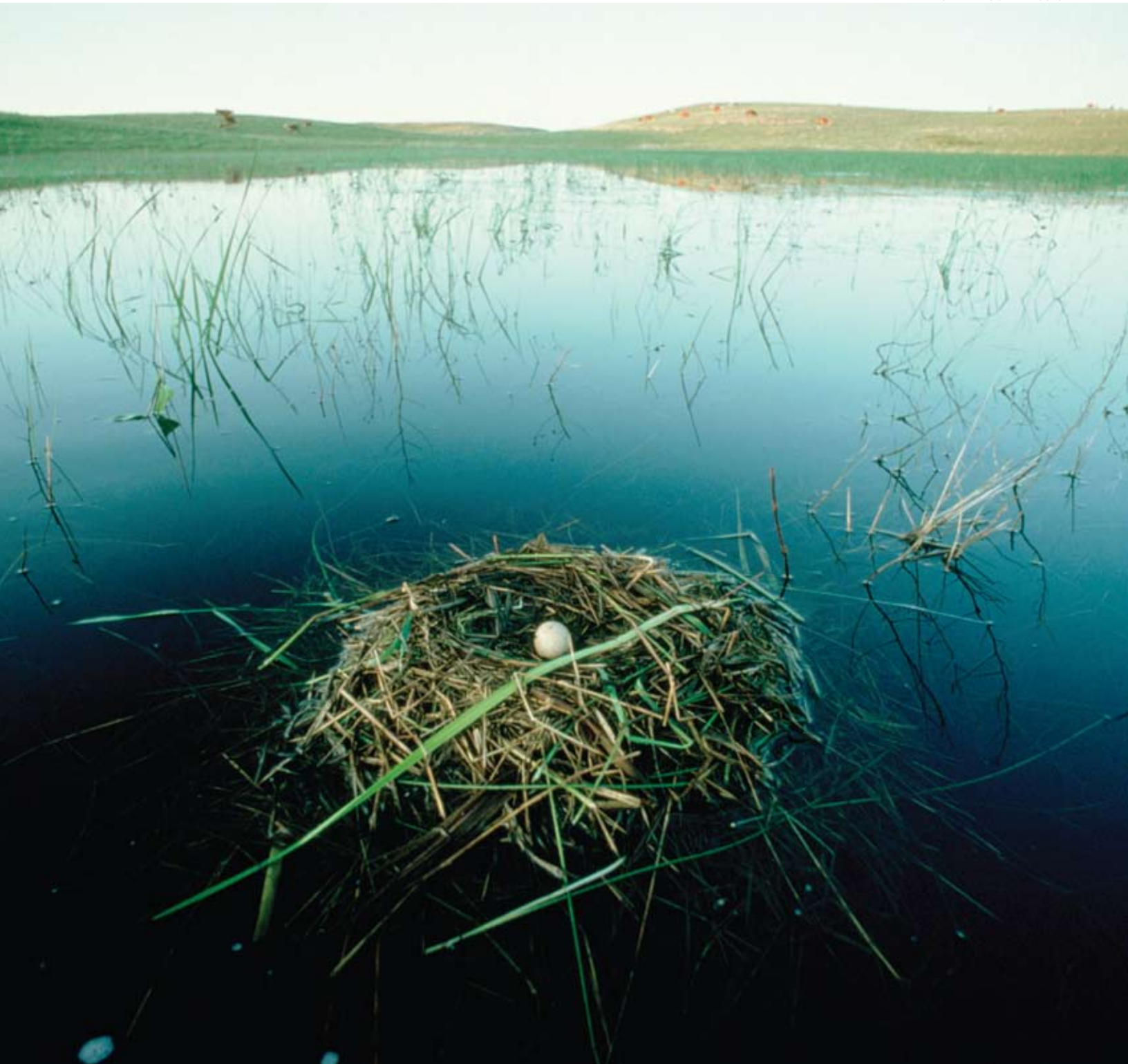
A western grebe nest floats from its tether of submerged vegetation in a South Dakota prairie pothole. Global warming could dry up the heartland marshes where 80 percent of America's waterfowl are born.