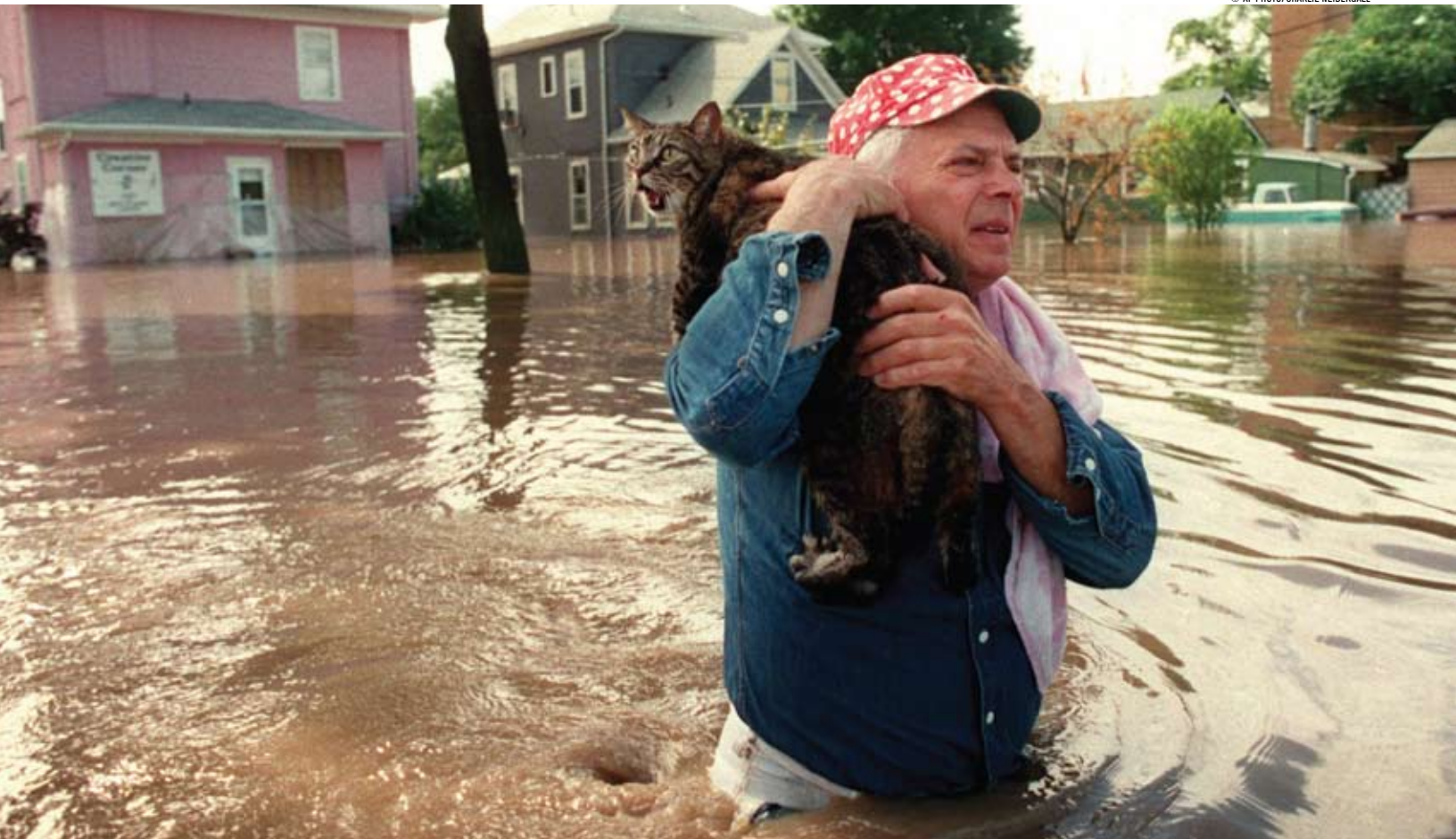
A resident of West Des Moines, Iowa, carries his cat down a flooded street. In the central states, warmer, moister air is causing heavier precipitation and bigger and more frequent floods.