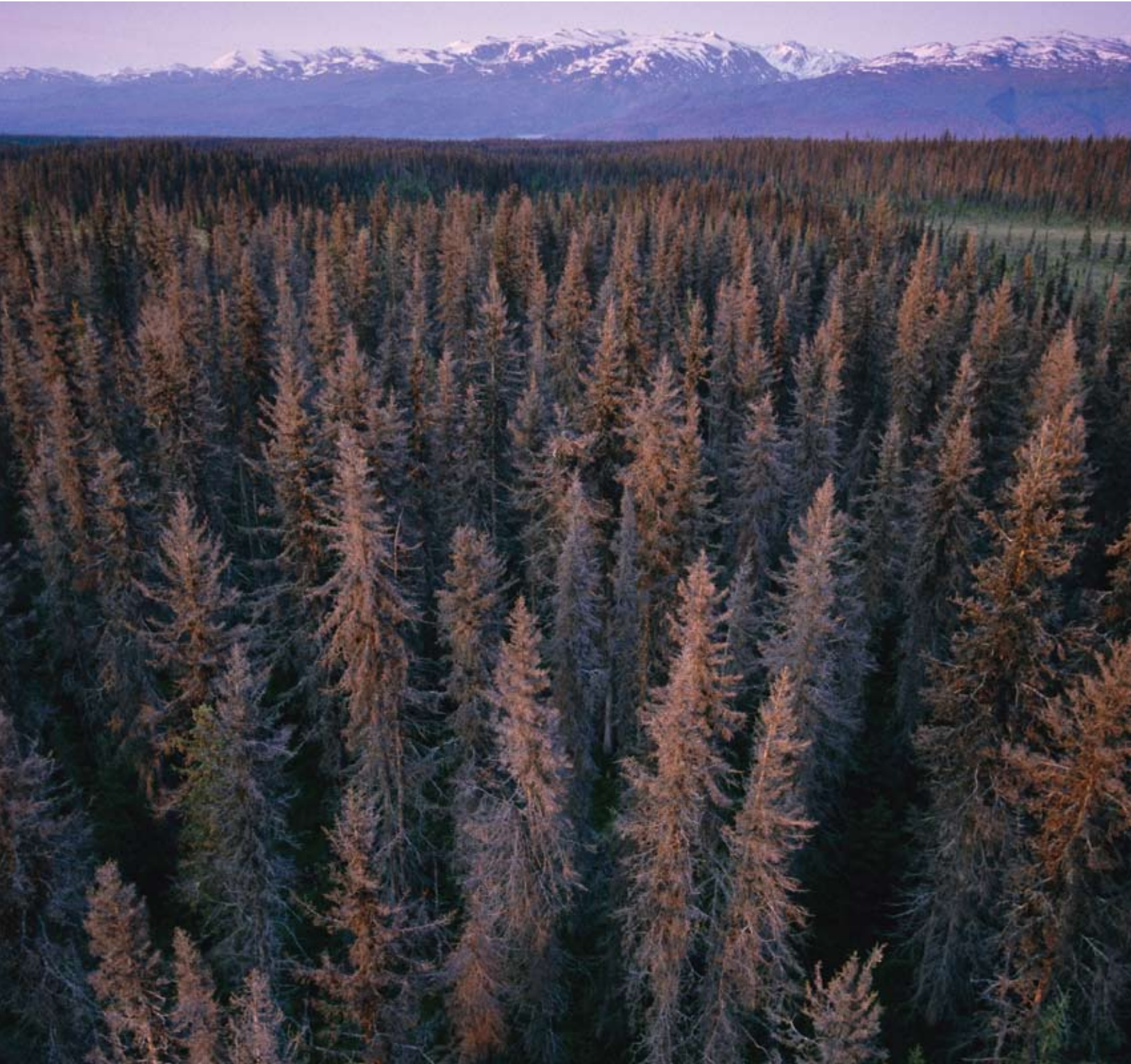
Spruce trees decimated by the spruce bark beetle near Homer, Alaska. Populations of this forest pest are increasing with the record-high temperatures and dry summers caused by global warming.